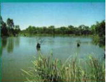
Upper Gunbower Lagoon

Safes Lagoon is a 66.87 ha wetland located five kilometres South of Koondrook. The lagoon is a natural billabong. It is shaped by a single circular channel which meets at a junction at Gunbower Creek. Historically the lagoon has supported a very high diversity of waterbirds, large bodied fish, freshwater turtles and frogs. A number of fish eating birds and birds of prey use the lagoon for breeding. Many significant threatened bird species including the Blue Billed Duck, Little Egret and White-bellied Sea Eagles have been recorded at this Lagoon.