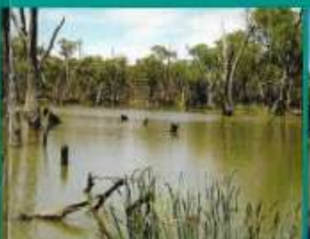
Heart Shape Lagoon