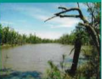
Black Charlie Lagoon